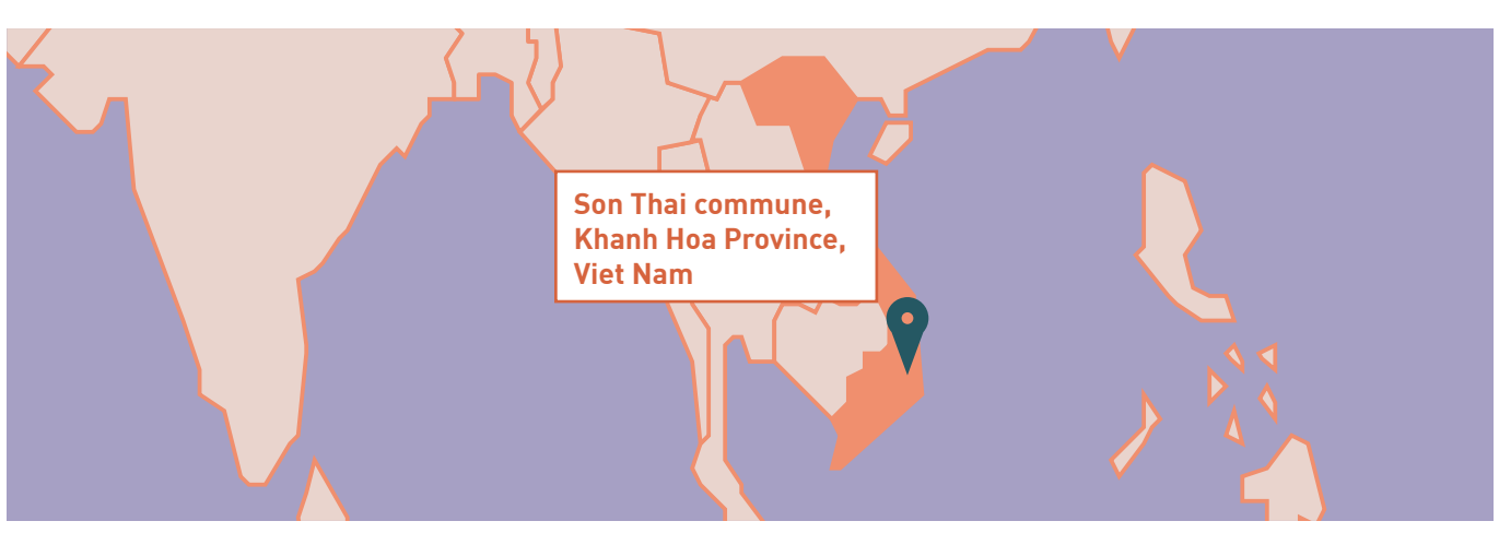
Full details of experiments carried out are available on:

Methods: Temperature, relative humidity and light intensity were detemined using a weather data logger.