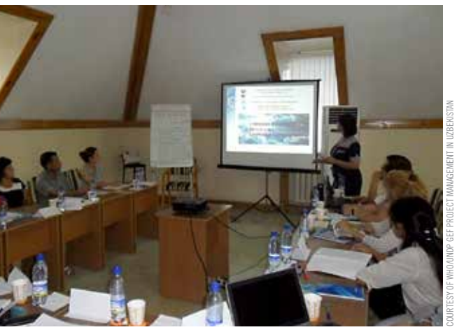
A workshop on strengthening early warning and response systems in progress in Uzbekistan (UNDP/ WHO GEF project).

• Adopting a broad approach. An "all hazard" approach, as used in the BMU projects, can effectively promote resilience.