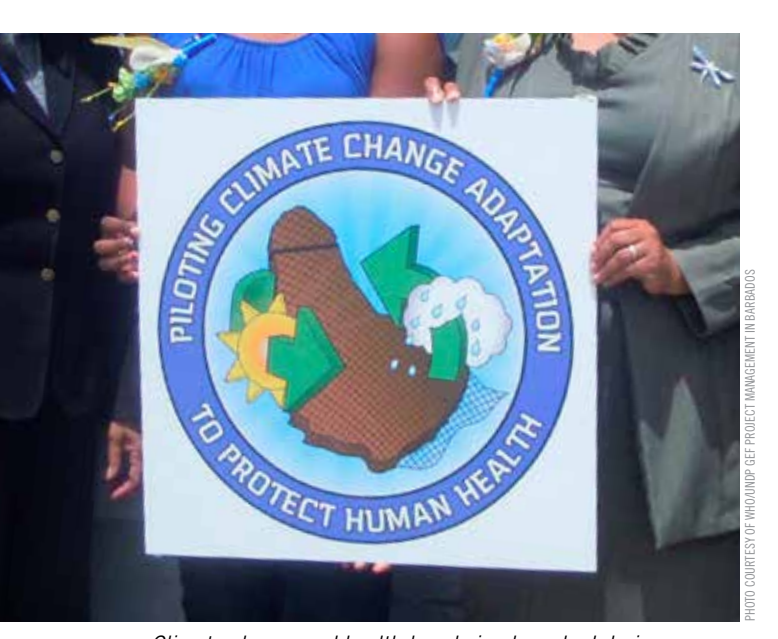
Climate change and health logo being launched during a media event in Bay Street, Bridgetown, Barbados.

One approach to handling these uncertainties is adaptive management, which is a structured, iterative process of decision-making in the face of imperfect information. Adaptive management aims to reduce uncertainty through M&E. It recognizes the uncertainties associated with projecting future outcomes and considers a range of possible future outcomes when formulating interventions. Interventions are designed to be flexible, taking into account multiple stakeholder objectives and preferences, and are subject to adjustment in an iterative, social learning process. Adaptive management encourages stakeholder engagement in decision-making, and aims to reduce decision-making gridlock by making it clear that decisions are provisional; there is often no "right" or "wrong" decision, and