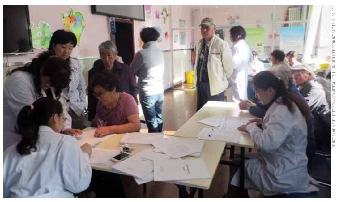
Using health records of community residents to establish a baseline for surveillance of health impacts of heat-stress with instruction from the local Centers for Disease Control and Prevention office in China (UNDP/WHO GEF project).

Strengthening primary health care, public health and laboratory services for climatesensitive health outcomes. All projects successfully included aspects of strengthening health systems. There are many examples of increasing the capacity of local and national actors to manage risks, including through monitoring and surveillance, altering current and planned programmes to incorporate risks associated with climate variability and change, incorporating health into climate change policies and strategies within and outside the health sector, and facilitating intersectoral cooperation and collaboration on climate change.