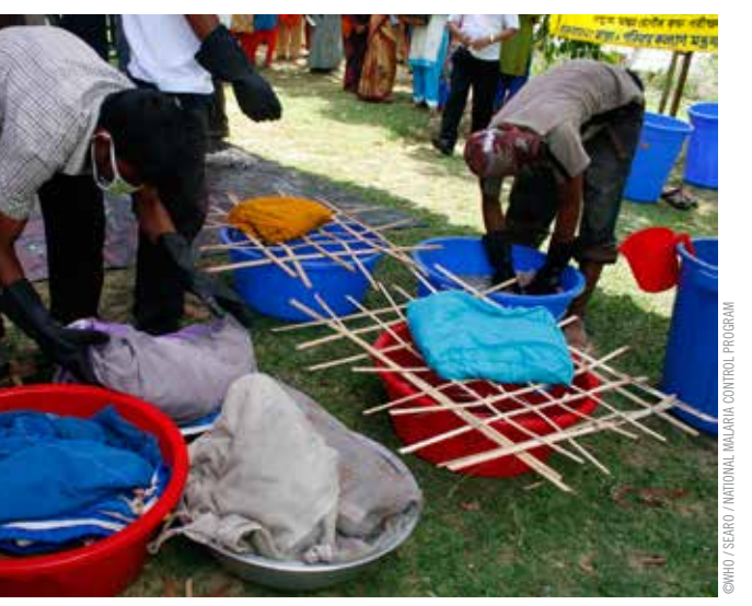
Bednets being treated with insecticide to prevent malaria in Bangladesh.

Most contributions were specific to malaria control interventions, diagnosis and allocation of resources, but not necessarily linked to the climate change aspects. This reinforces the importance of building climate resilience into everyday operations, as these are what the disease control programmes are struggling to improve on a day-to-day basis. Key informants said that service delivery faced several difficulties, including lack of up-to-date knowledge of policy changes and scientific progress among health workers entering the health system in malarial areas (K20), and involvement of private sector actors that were not using standard and up-todate management methods (K24).