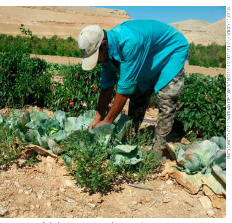
Safe food production using treated wastewater as an adaptation measure to offset water scarcity induced by climate variability in Jordan (UNDP/WHO GEF project).

Projects such as those in Jordan for the MDG-F and the UNDP/WHO projects specifically focused on establishing national enabling conditions. In Jordan's case, the UNDP/WHO project was designed to ensure that wastewater reuse is a sustainable management option for the country's water scarcity problems. The project built on the MDG-F project to address