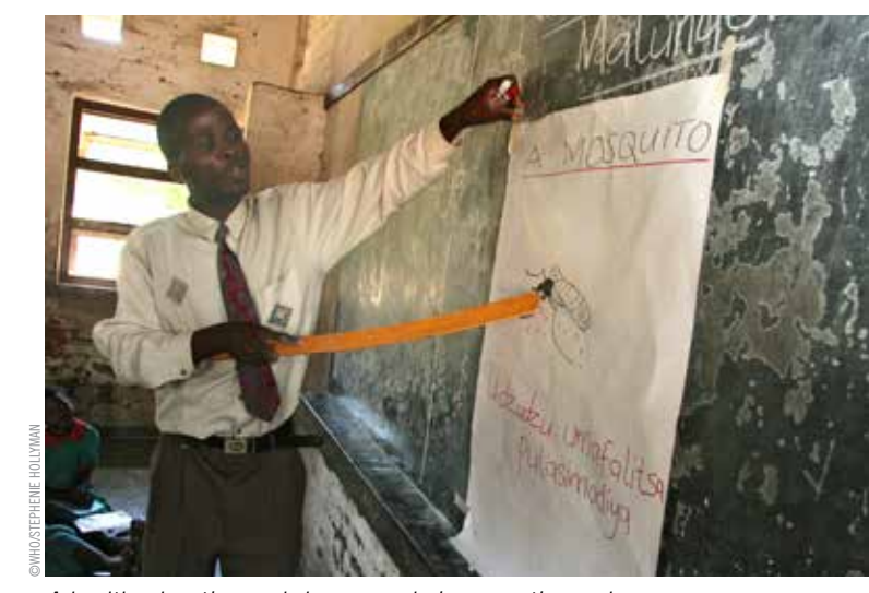
A health education workshop on malaria prevention and control in progress in Malawi.

An emerging theme that was given important attention by a majority of key respondents was the improvement in knowledge, awareness and capacities following various trainings and sensitization initiatives among the targeted communities, including health workers and decision-makers, at the national level (K1-3, K7-10, K13, K14, K16-19). Equipment supply was reported to have improved, which contributed to the effective implementation of projects, especially in relation to EWS (K19) and MoH drinking water laboratories in some cases (K11, K19).