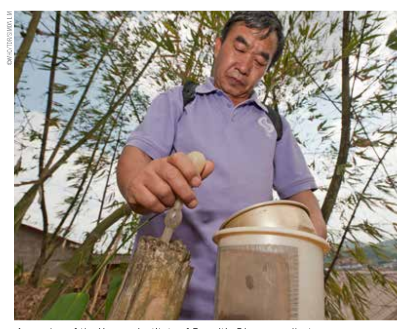
A member of the Yunnan Institute of Parasitic Diseases collecting water from a bamboo shoot to check for mosquito larvae in Simao, Yunnan Province, China.

Health decisions should be informed by evidence that meets standards of accuracy, timeliness and relevance in each specific context. It is well known that information has political value and decision-making processes require, in both developed and developing countries, access to robust evidence for action pertaining to climate-sensitive diseases and resilience of health systems. When this scenario does not occur, implementation of evidence-based health adaptation measures and strategies is affected, for example by lack of quality-assured climate information at appropriate temporal and spatial scales to inform actionable health decisions.