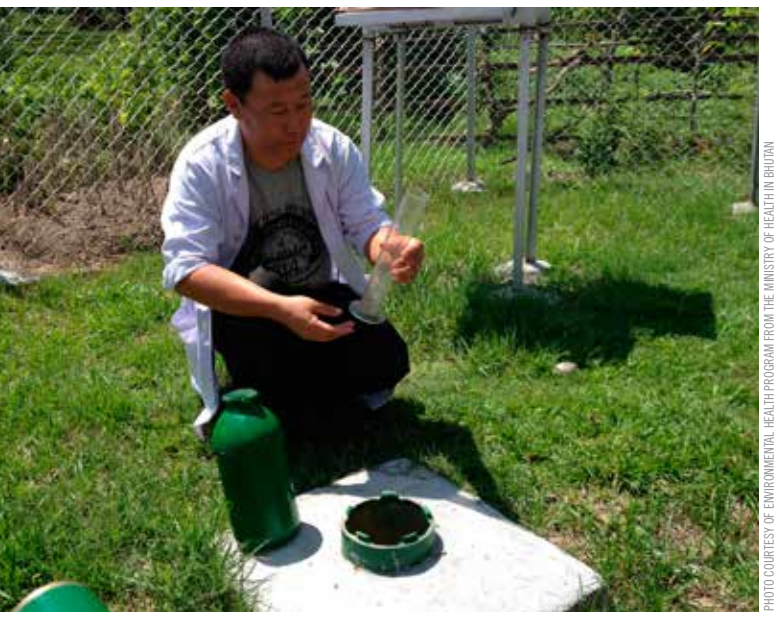
A health worker collecting weather data at a Basic Health Unit premises as part of an integrated surveillance for climate sensitive diseases in Bhutan.

However, some key informant voices emphasized that there is still a long way to go, despite the good momentum towards an institutional set-up that coordinates action on health and climate change (K5), and particularly within some ministries of health, where climate change is still not sufficiently taken into consideration: