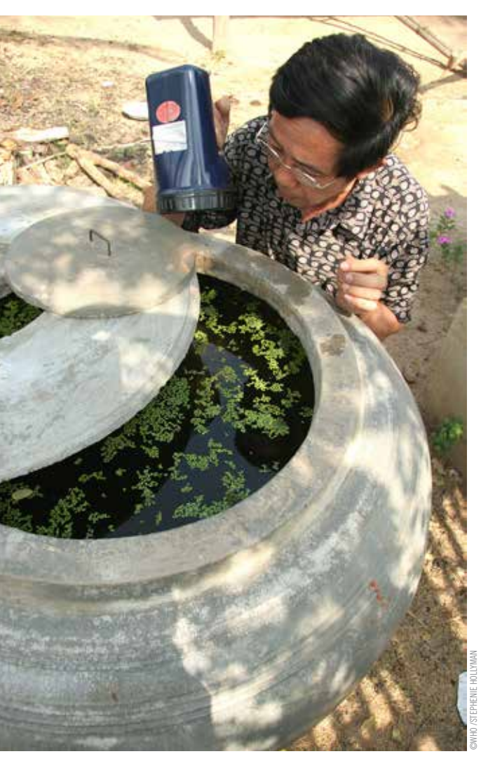
In Cambodia a pilot study is underway to discover the efficacy of using fish for larval control in water jars to prevent dengue outbreaks in communities.

The latest WHO risk assessment of the effects of climate change on selected causes of death (15) shows that climate change is expected to cause approximately 250 000 additional deaths per year between 2030 and 2050, taking into account a subset of the possible health impacts. Despite available evidence on the effects of climate change on human health, projections for future years showing additional yearly deaths due to climate change are not always taken into consideration when there is a need to justify current funding streams. Positive outcomes of ongoing disease control programmes need to be reconciled with the acknowledgement of climate change as a threat to human health: